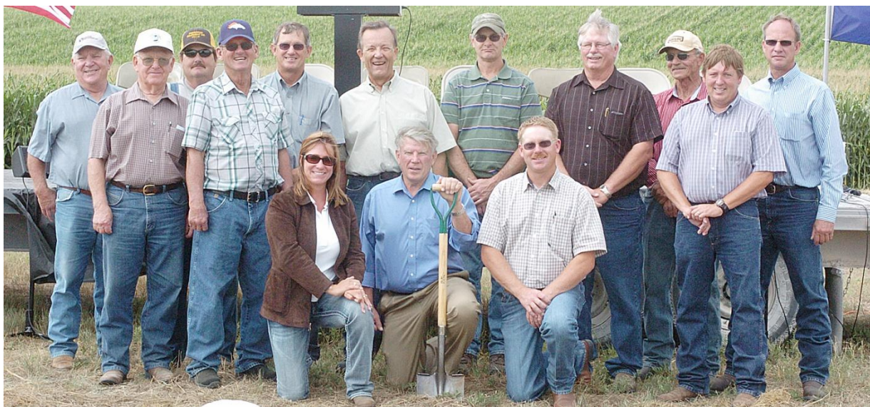
RRWCD Board of Directors at the Groundbreaking Ceremony – August 29, 2011

Final completion of the pipeline is scheduled for the end of September. The Compact Compliance Pipeline Dedication ceremony is being held today, August 16, 2012.